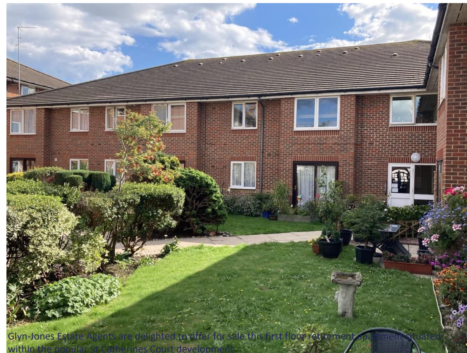
Glyn-Jones Estate Agents are delighted to offer for sale this first floor retirement apartment situated within the popular St Catherines Court development.

The accommodation comprises; an entrance hall with built in storage cupboards, a spacious lounge/diner, a fitted kitchen, wet room/w.c as well as one double bedroom. In our opinion the property is presented in good clean decorative order and benefits from modern electric heating.